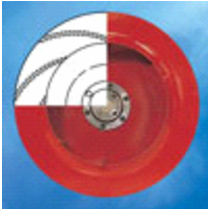
Clean Air Impeller - Type R The clean air impeller is a closed bladed impeller with backward curved blades. This impeller is used for transport of clean air and of air with a small quantity of fine dust, such as welding smoke, oil mists or exhaust gases. The clean air impeller has an efficiency of up to 87%.